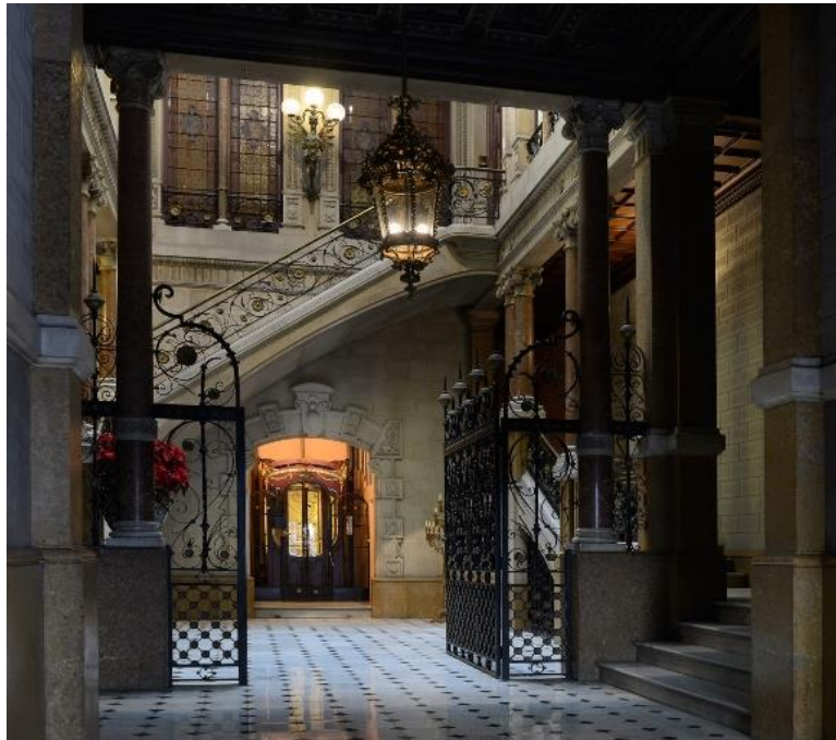
BuildingsSpain, entrance Barcelona office